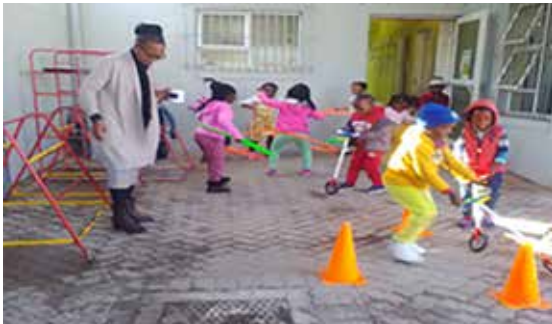
As Pretty desperately wishes for a canopy on the playground of her kindergarten, the Wood Student Foundation is once again stepping in to provide funding.